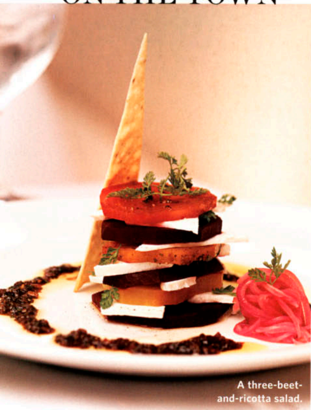
A three-beet-and-ricotta salad.