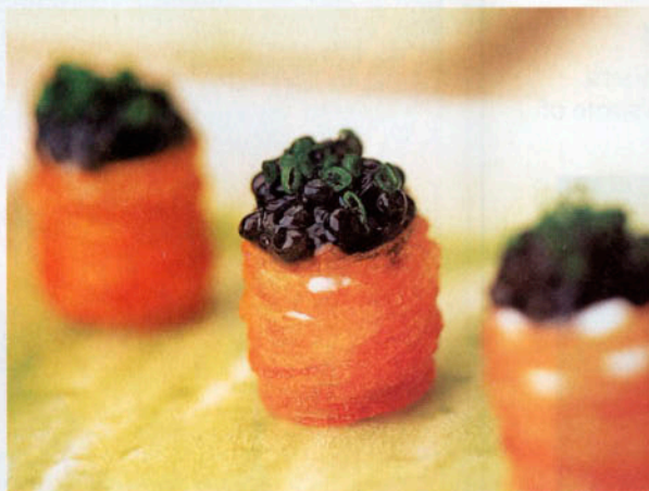
Sevruga caviar potato tube with lemon cream cheese

Instructions: Mix basil, lime juice and sugar and refrigerate overnight. Pour over a glass of ice, then add rum, shake, top with soda and add lime wheels.