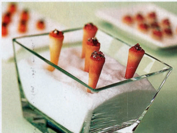
Tequila-cured salmon "cones" in serrano cream cheese