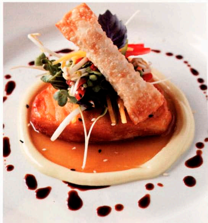
Espresso Float (left) and Flo Encrusted Chilean Sea Bass